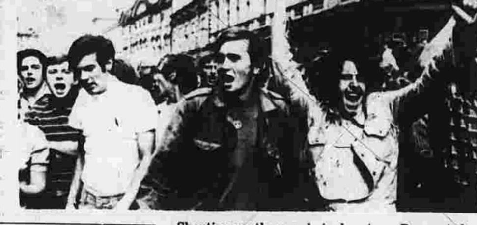
Shouting youths parade in downtown Prague today as Czechoslovak marks the first anniversary of the Soviet invasion. Wenceslas Square is in background.