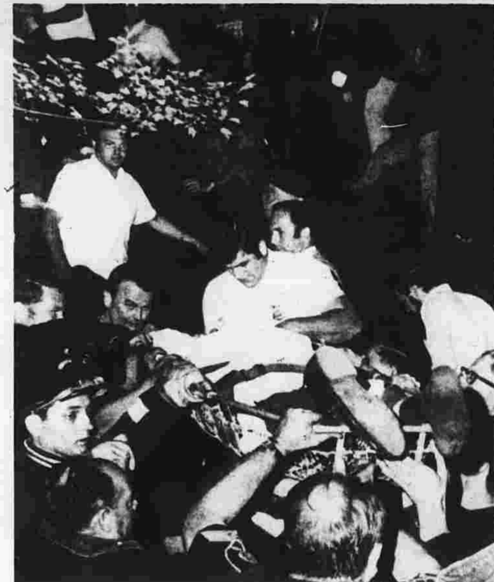
Rescue workers remove victims of two-train collision on a stretcher Wednesday night at Darien, Conn. Four persons were killed and 31 were treated at hospitals after the two Penn Central trains hit each other head-on.

PRAGUE (AP) — Police and riot troopers made re- peated tear gas and night- stick attacks today to break up a giant "Russians go home" demonstration here on the first anniversary of the Soviet-led invasion of Czechoslovakia. The chanting and horn- blowing demonstration was permitted to run for 40 minutes before the police and army ri- valled to break the crowd of about 50,000 in downtown Wre- cles. There were also booting, regu- latory chants of Husak, Nisak, for Gustav Husak, the Czech leader who suc- ceeded to power in April. Many Czechoslovaks stood on the sidewalks applauding as the young demonstrators started a slow moving parade through the square and into the major thor- oughfare at one end. A few minutes later, the great crowd surged back through the square to the opposite end, at- tacked by riot troopers and the use of tear gas. This was according to a pa-