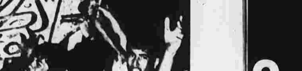
Arabs carry an inscription from the Koran from Old Jerusalem's El Akash Mosque, a wing of which was ruined by fire Thursday. The Arabs are cursing the Jews whom they blamed for the blaze. See story page nine.